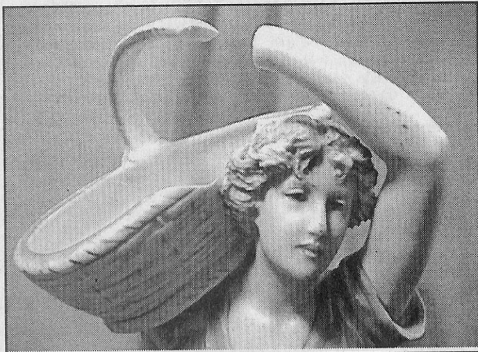
Dental bonding products are strong and can be mixed to match colors.