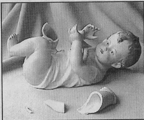
Piano Baby Boy bisque figurine with broken leg and fingers. Photo below shows baby all "cured."

Dental products include materials which are plain white opaque, various hues of tooth shades (great for body types such as alabaster and ivory) and translucent materials of vibrant jewel colorations, frosted or clear. These products can be used in